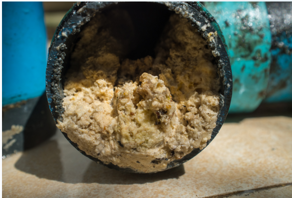
FOG build-up in a private sewer lateral